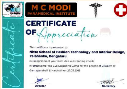
M C Modi - Certificate of Appreciation