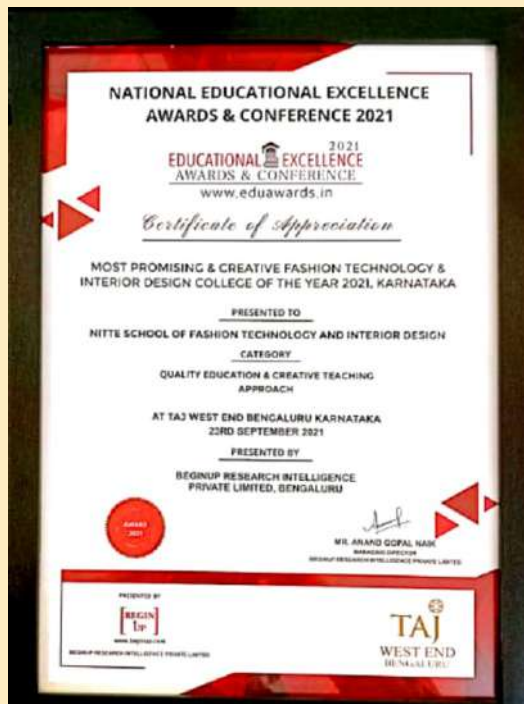
Educational Excellence Award - Beginup Research Intelligence