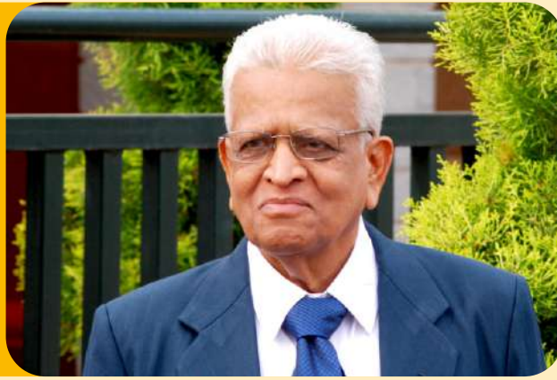
ADVISOR, NITTE EDUCATION TRUST

President, Indian Society for Technical Education, New Delhi, is the guiding spirit in the continuous success of Nitte Group of Institutions, Bangalore. He is also Vice-President of International Federation of Engineering Education Societies (IFEES), Washington D.C, USA and President of Forum of Former Vice-Chancellors of Karnataka State universities. He also served as Vice Chancellor Bangalore University for two terms.