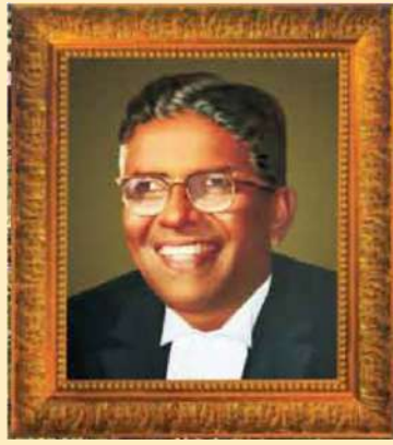
Justice K. S. Hegde