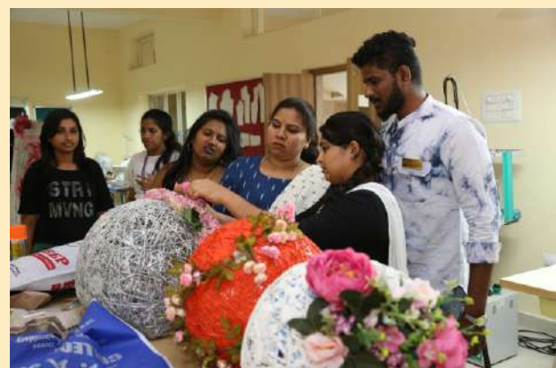
Laboratories and Facilities available