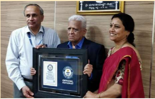
Guinness Book of Record