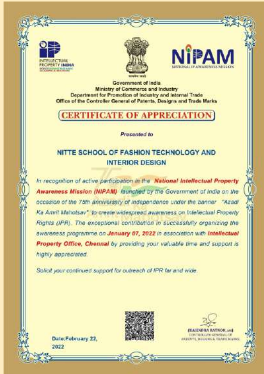
Certificate of Appreciation - NIPAM