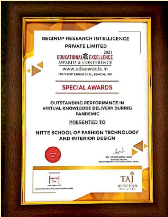
Educational Excellence Award - Beginup Research Intelligence